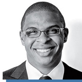
Roland G. Fryer (Harvard University)