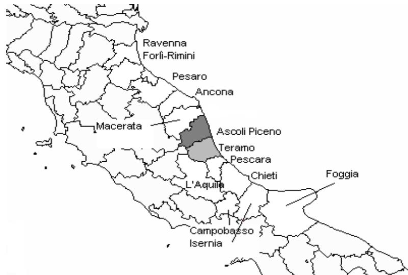
Figure 3: Provinces of Marche and Abruzzo included in Sample_2 (shaded area).