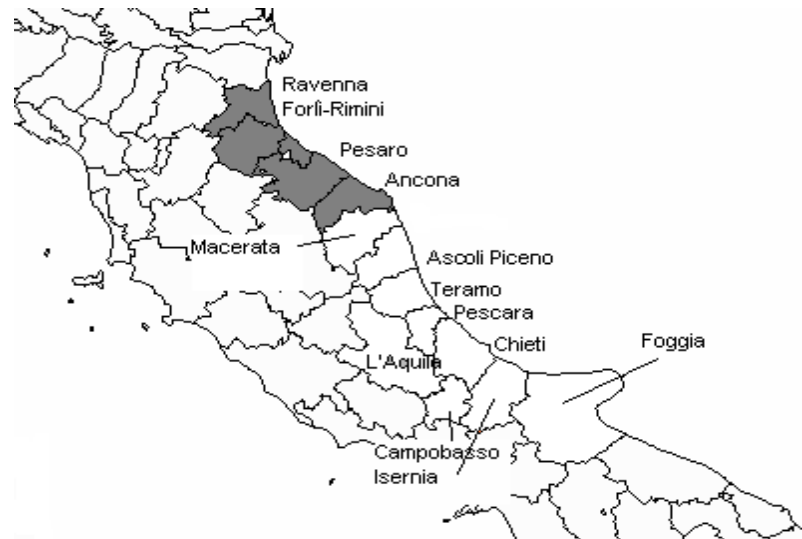
Figure 7: Provinces of Abruzzo and Molise and Puglia included in Sample_2^* (shaded area).