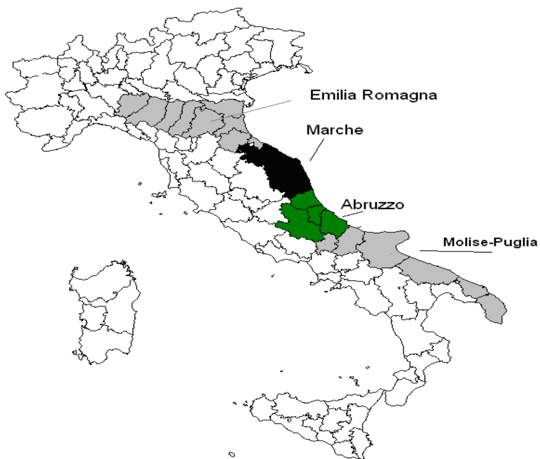
Figure 1: Marche and Abruzzo and other bordering regions.